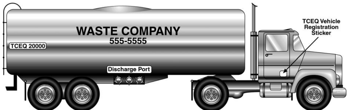
Figure 1. Example of vehicle marking and sticker placement.